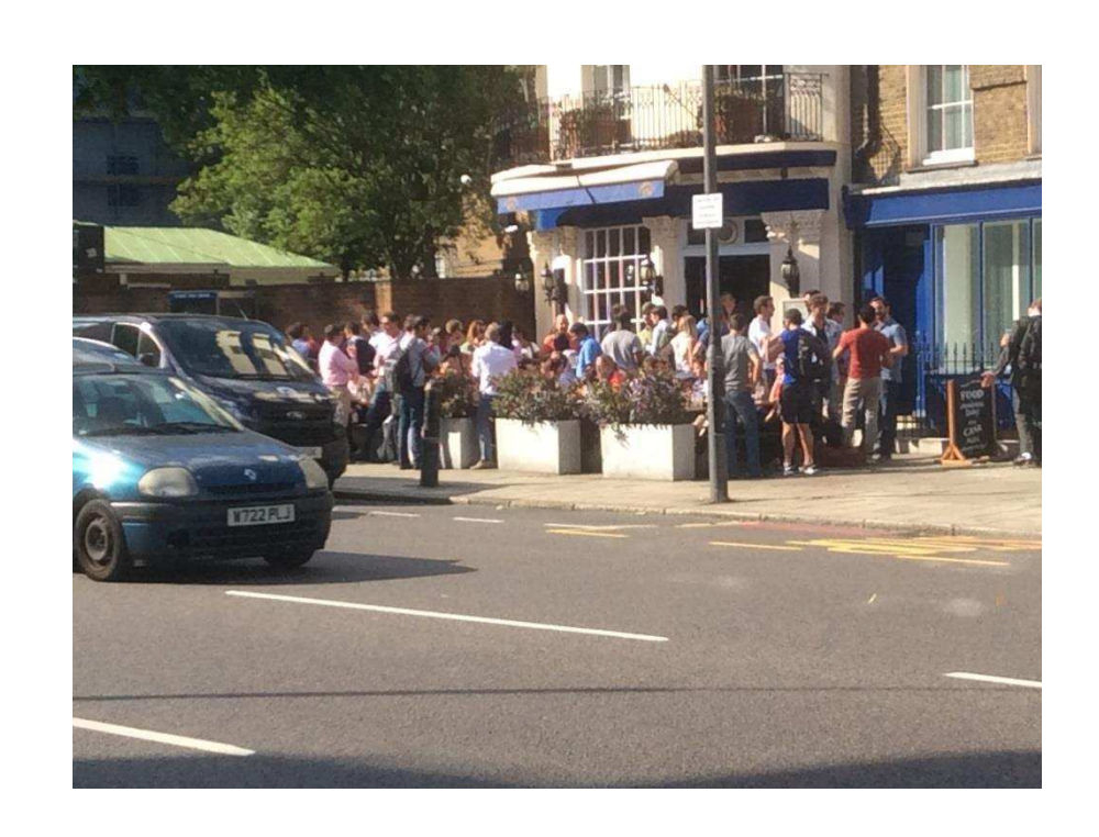
19<sup>th</sup> July 2015 – 18:14