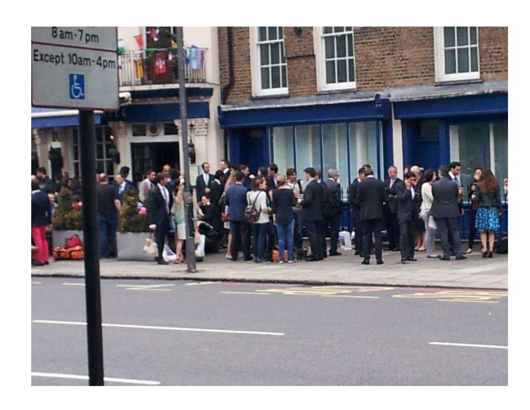
17<sup>th</sup> July 2014 – 20:41