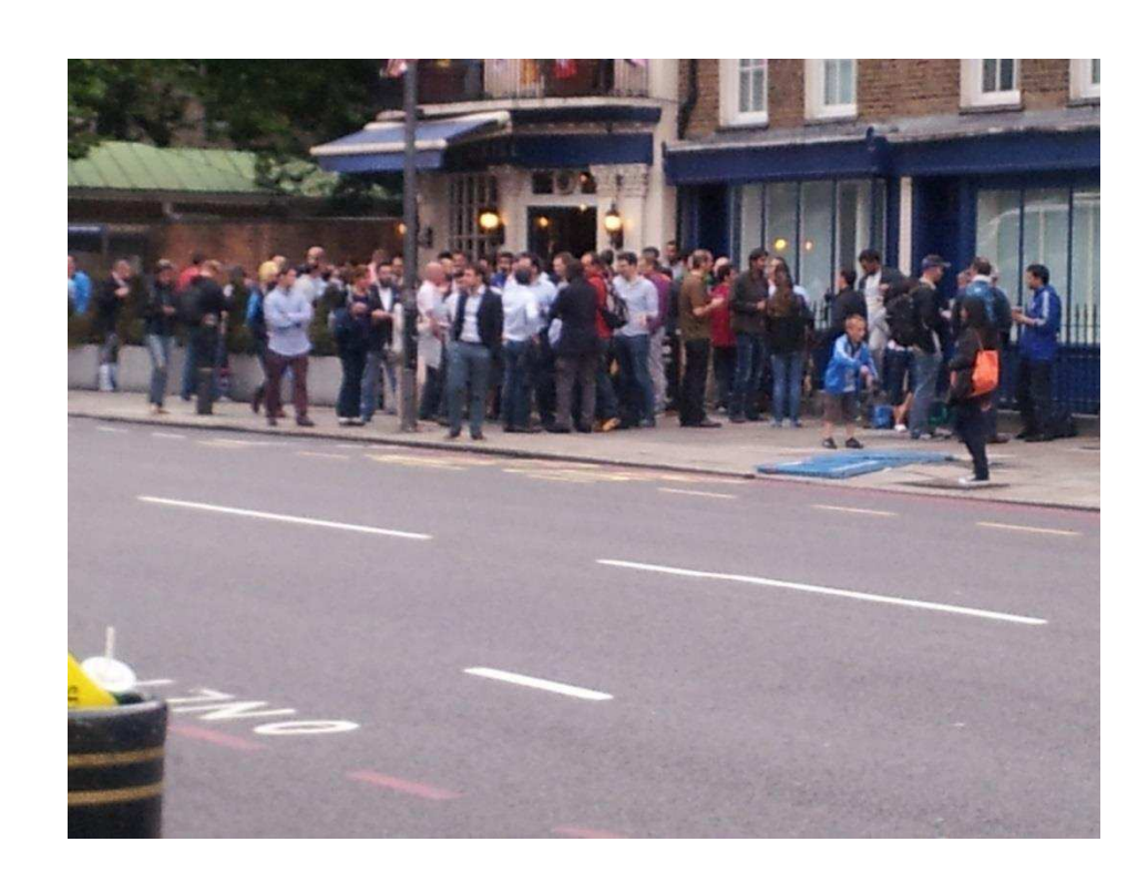
11<sup>th</sup> July 2015 – 17:44