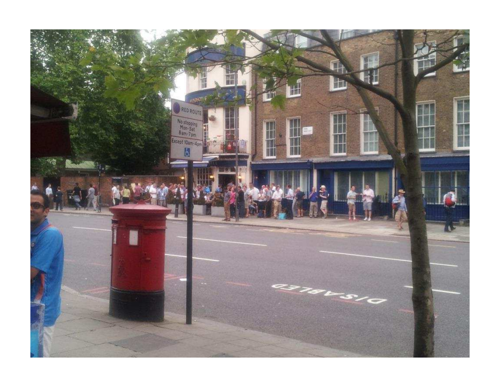
6<sup>th</sup> August 2014 – 20:44