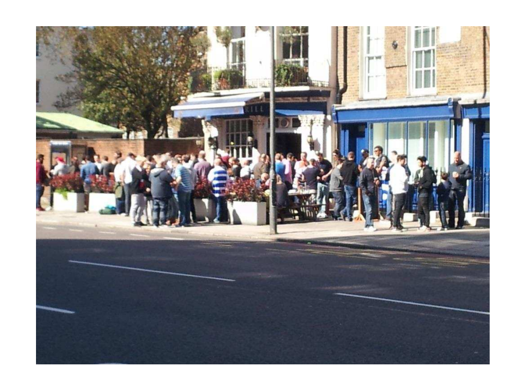
18<sup>th</sup> July 2014 19:58