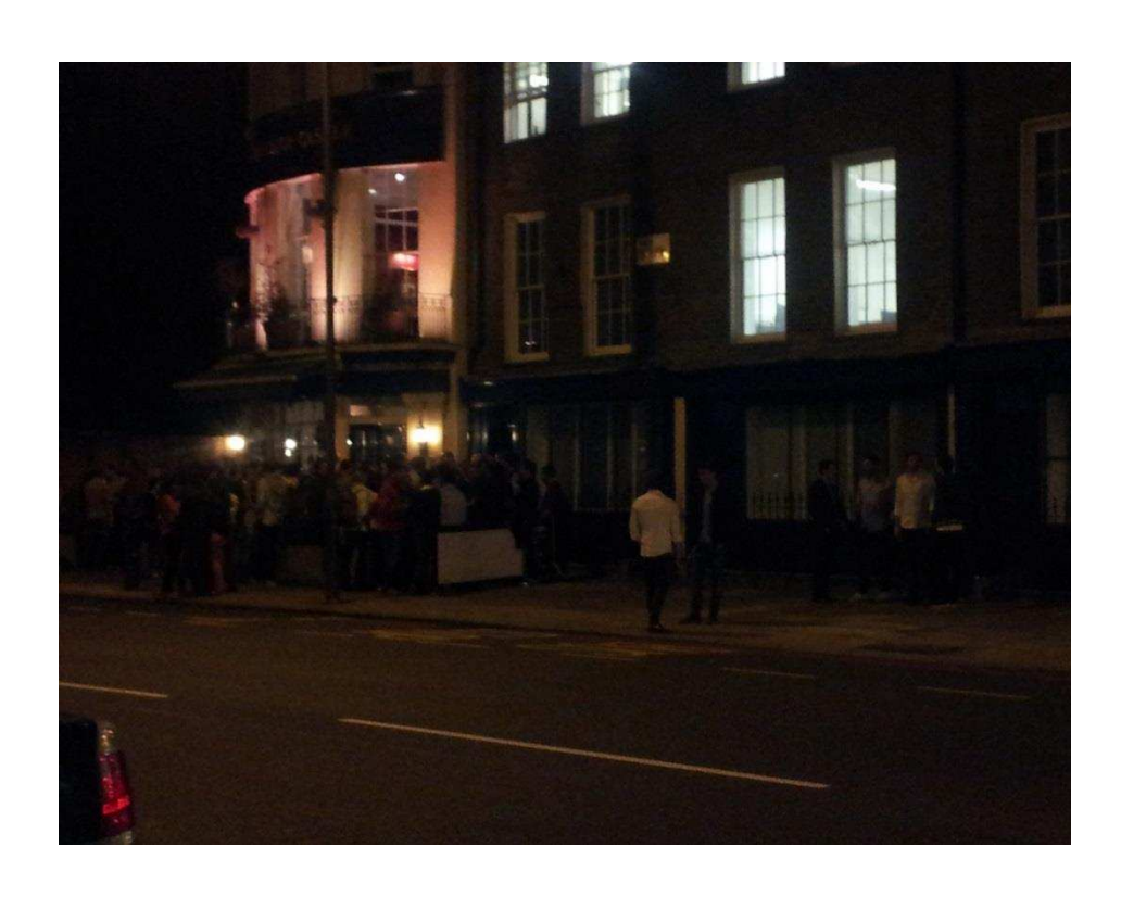
17<sup>th</sup> April 2015 – 17:23